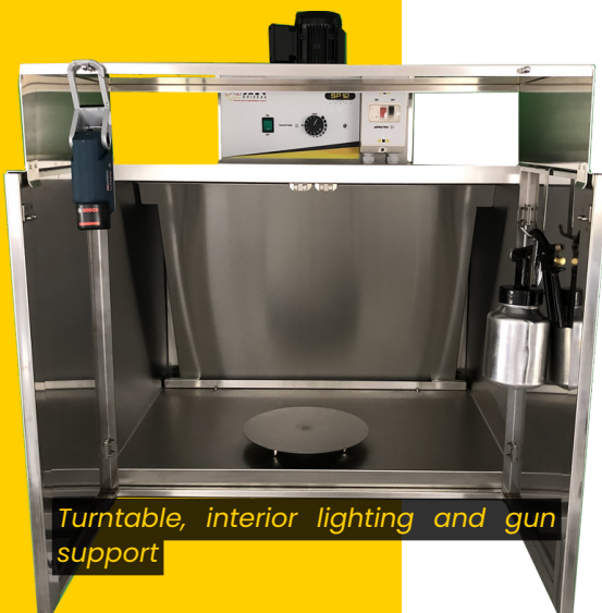
Turntable, interior lighting and gun support