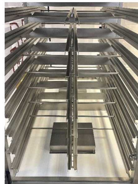
Large storage volume