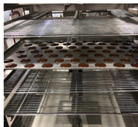
Products on plates/grids